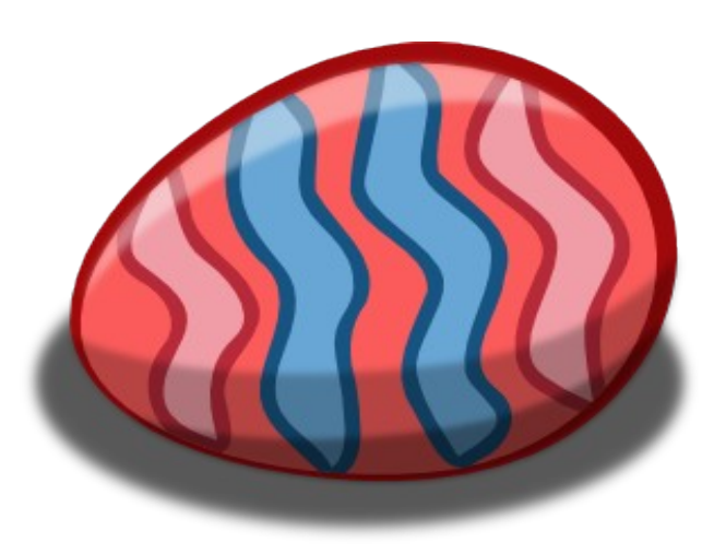
Play with a huge crescendo to the end!