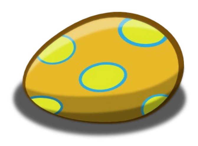
Play with your eyes closed!